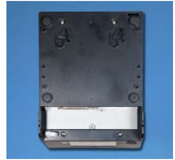
Built-In Wall Mount Capability