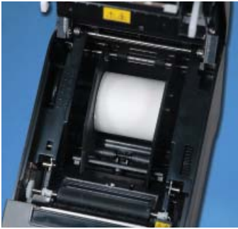
Drop and Print Paper Loading with an Adjustable Paper Width Selector