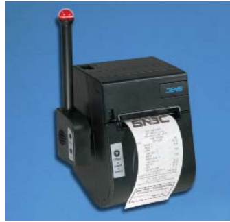
Optional Audio/Visual Print Messenger