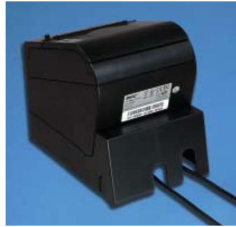
Optional Power Supply Cover with Cable Management Slots