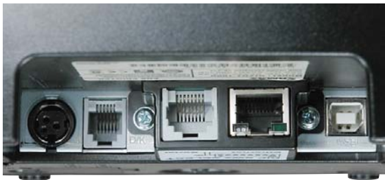
Triple Interface Standard

Distinctive in its small size the Giant 100 has the features and speed of much larger 3" printers.