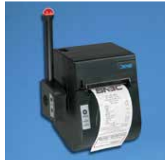
Built-In Wall Mount Capability and Optional Audio/Visual Print Messenger