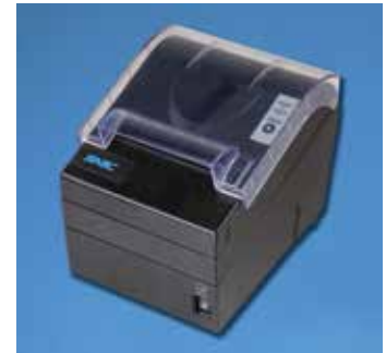
Optional Spill Cover