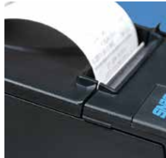
Liquid Guard Built Into the Cabinet Design