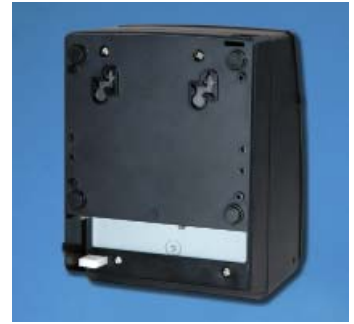
Built-In Wall Mount Capability