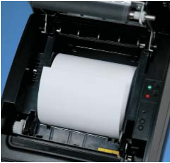
Drop and Print Paper Loading