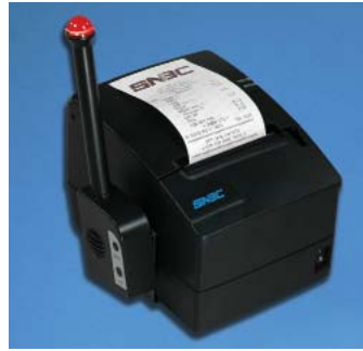
Optional Audio/Visual Print Messenger