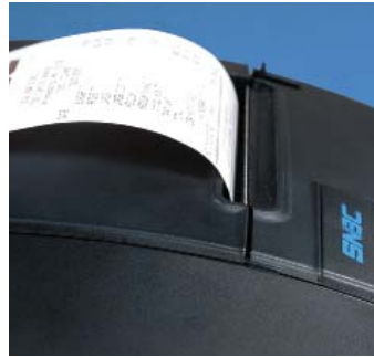
Liquid Guard Built Into the Cabinet Design