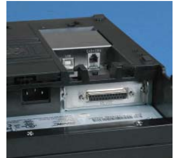
Concealed, Yet Easy to Access Power Supply – Dual Interface Boards Allow a Variety of Configurations