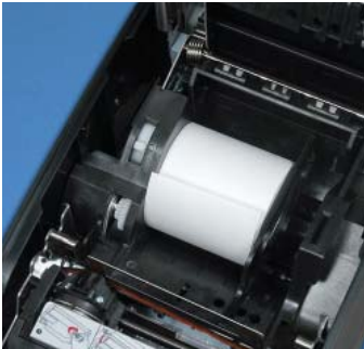
Drop and Print Paper Loading with Built-In Paper Width Selector