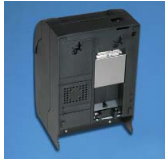
Built-In Wall Mount Capability