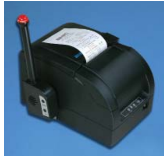
Optional Audio/Visual Print Messenger